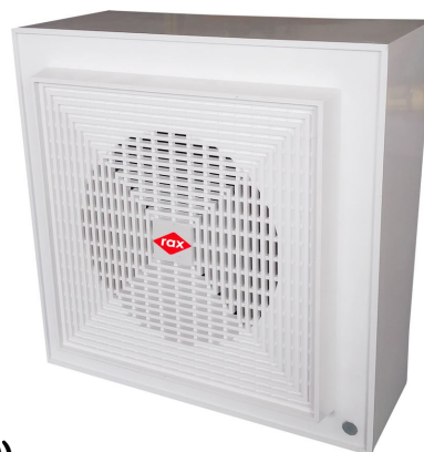
RT-2WC-D33 (CEILING MOUNTED)